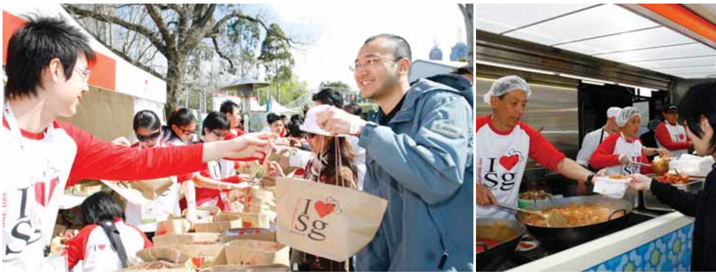
Top left: Singapore Day 2008 held at Melbourne in October drew an enthusiatic crowd of 11,000 visitors. Top right: Visitors to the Singapore Day 2008, held at the iconic Sidney Myer Bowl in Melbourne, were treated to a sumptuous spread of Singaporean cuisine. Opposite page (in some boxes): Singapore's well-known comedian Phua Chu Kang was part of the 200-strong Singaporean team flown down especially for the event.

ingapore's national dish, Hainanese chicken rice, was among the favourite dishes served at the Singapore Day held in Melbourne, Australia on 4 October last year. The event was the second successful instalment of the Singapore Day events organised by the Overseas Singaporean Unit, aimed at reaching out to the estimated 150,000 Singaporeans working and studying around the world.