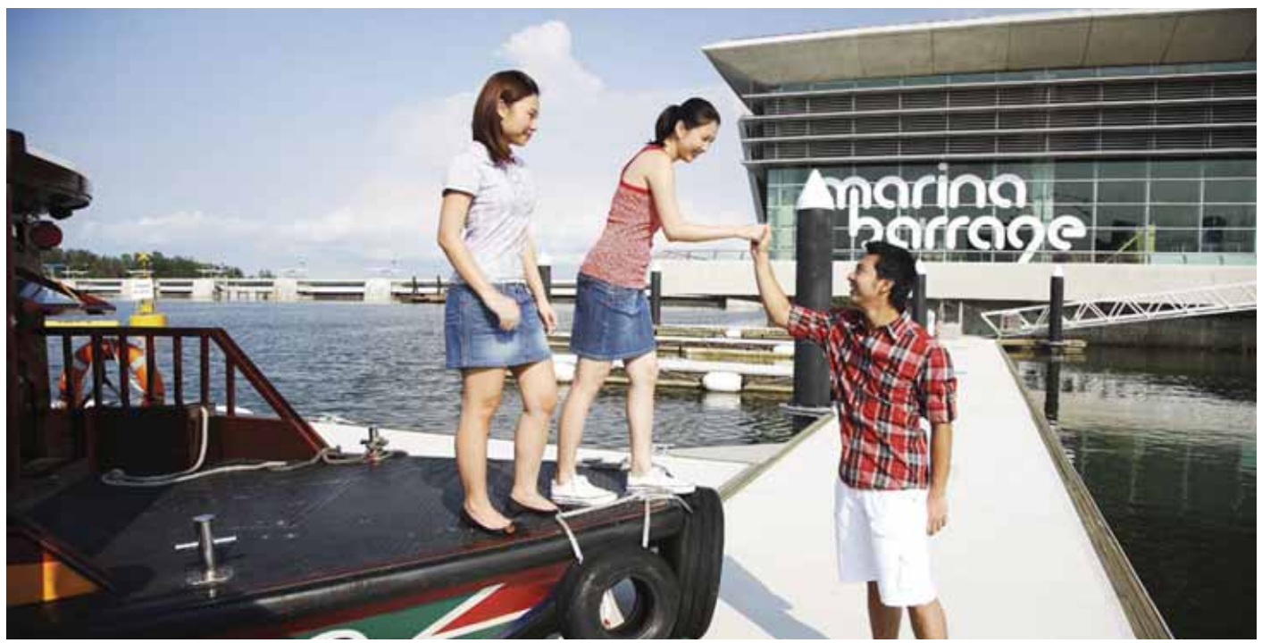
The Marina Barrage is set to play host to many recreational activities as part of Singapore's next phase of development to be an exciting "live-work-play" destination.