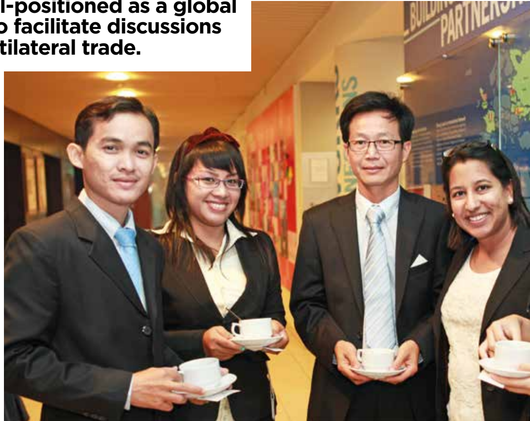
↑ Participants of the Singapore-US Third Country Training Programme joint training course on Investment and Trade Facilitation, held in August 2013

The Republic has a network of about 20 free trade agreements, and is constantly looking for opportunities to expand cooperation in trade with other countries. For instance, it is currently involved in negotiations for major regional trade agreements, such as the Trans-Pacific Partnership and the Regional Comprehensive Economic Partnership. It is also