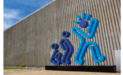
ON THE COVER: "Evolution of Man: Poo Pee Happy" is a quirky sculpture commissioned by the World Toilet Organisation, which has been raising awareness about the importance of proper sanitation since 2001. November 19 was officially designated World Toilet Day by the United Nations in July 2013.