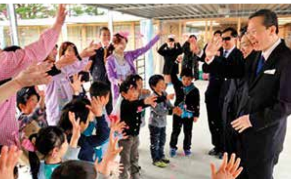
↑ A Year of Helping , pg10

A year of helping Experience Singapore looks back at some instances of how the Republic extended a helping hand in 2013