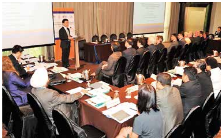
↑ Singapore's Senior Minister of State, Trade and Industry, and National Development, Mr Lee Yi Shyan, was the Guest-of-Honour and keynote speaker at the Policy Dialogue.

Third Country Training Programme, offering participants the chance to learn from the experiences and trade models of both Singapore and the United States.