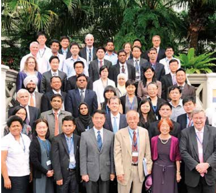
← Participants of the Singapore-WTO Dialogue 2013, organised by the Centre for International Law, National University of Singapore.