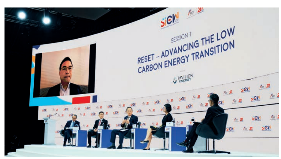
ADVANCING THE LOW-CARBON ENERGY TRANSITION WAS A KEY FOCUS OF THE SINGAPORE INTERNATIONAL ENERGY WEEK 2021

A key focus of Singapore's international engagement strategy is to learn from and contribute to the international discourse on best practices and capacity-building. Singapore has been playing an active role in international