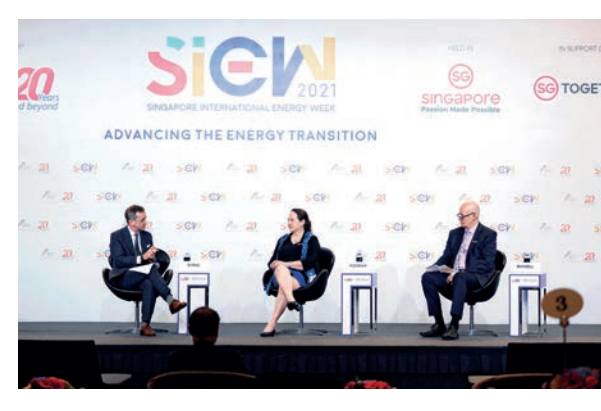
SPEAKERS AND ATTENDEES OF THE SINGAPORE INTERNATIONAL ENERGY WEEK 2021 REPRESENTED MORE THAN 80 COUNTRIES.

SIEW is the flagship event of Singapore's Energy Market Authority (EMA) which marked its 20<sup>th</sup> year as Singapore's regulatory steward for the energy sector. EMA celebrated this milestone through the launch of a 20<sup>th</sup> anniversary book that chronicles Singapore's Energy Story.