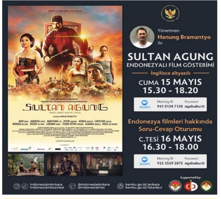
Web seminar on the Indonesian Movie topic hosted by a wellknown Indonesian filmmaker, Mr. Hanung Bramantyo

The webinar received wide acceptance from the public, not only from those who live in Turkey but also those residing in Indonesia and other parts of the world. A webinar themed about the role of women, featuring Ms. Najwa Shihab, a TV anchor, was participated by more than 1000 viewers from all over the world.