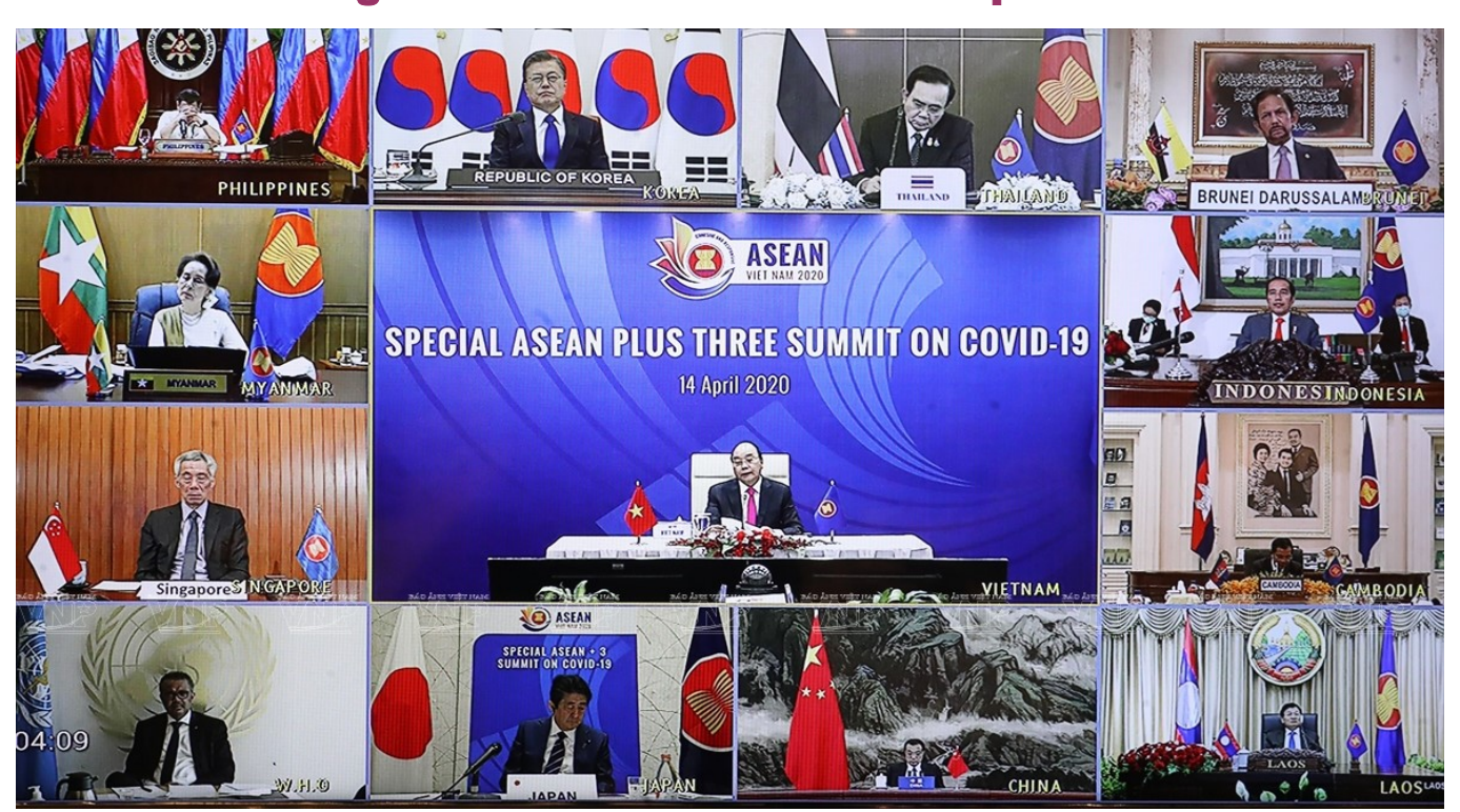
The online Special ASEAN+3 Summit with China, Japan and the Republic of Korea (RoK) on the COVID-19 response -Chaired by Vietnam's Prime Minister Nguyen Xuan Phuc

This year, Vietnam has taken on the role of ASEAN Chair and the non-permanent seat in the United Nations Security Council (UNSC) from 2020-21 which is also expected to help the country to further raise ASEAN's profile within the international community. During its Chairmanship, ASEAN will follow the main focus as follows: