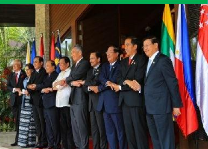
There are two observer nations: Papua New Guinea and Timor Leste.

Brunei Darussalam then joined on 7 January 1984, Viet Nam on 28 July 1995, Lao PDR and Myanmar on 23 July 1997, and Cambodia on 30 April 1999, making up what is today the ten Member States of ASEAN.