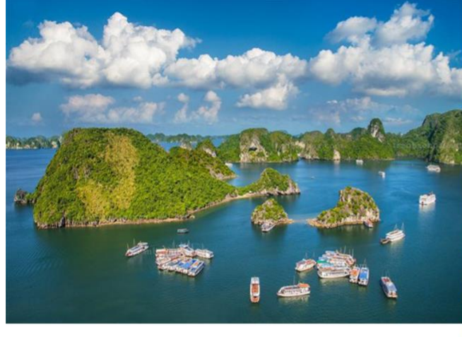
Ha Long Bay, Quang Ninh Province - One of the New 7 Won-ders of Nature

Machine Building, Mining, Coal, UN, ASEAN, APEC, ASEM, and Steel, Cement, Chemical Fertiliz-