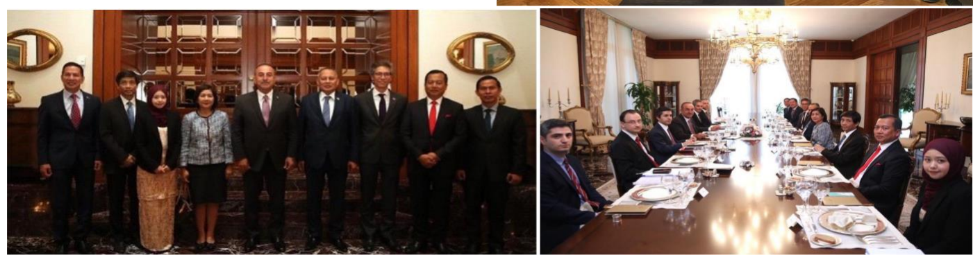
JOINT MEAL WITH MINISTER OF FOREIGN AFFAIRS OF TURKEY

On 11 July 2019, H.E. Mevlüt Çavuşoğlu, the Minister of Foreign Affairs of Turkey hosted the AAC Heads of Mission to dinner at his residence.