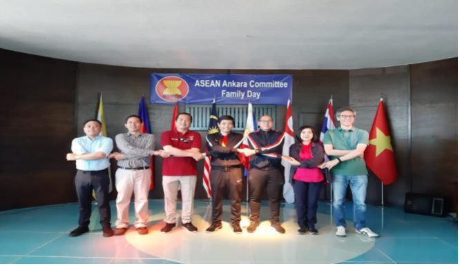
ASEAN FAMILY DAY