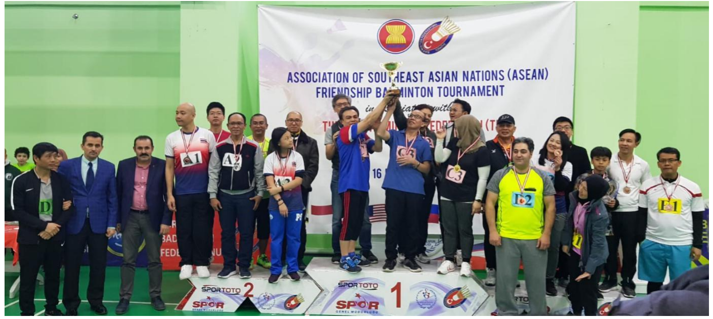
ASEAN Friendship Badminton Tournament 2019 at Kecioren TBF Badminton Hall, Ankara, organized by the ASEAN Ankara Committee (AAC)

ASEAN Friendship Badminton Tournament 2019 at Kecioren TBF Badminton Hall, Ankara, organized by the ASEAN Ankara Committee (AAC) in association with Turkish Badminton Federation (TBF), on Saturday 16, February 2019, participated by a large family of 7 (seven) representatives of ASEAN member countries in Ankara; Brunei Darussalam, Indonesia, Malaysia, the Philippines, Singapore, Thailand and Viet Nam. The tournament took place in a lively, sporty and in a warm familial atmosphere.