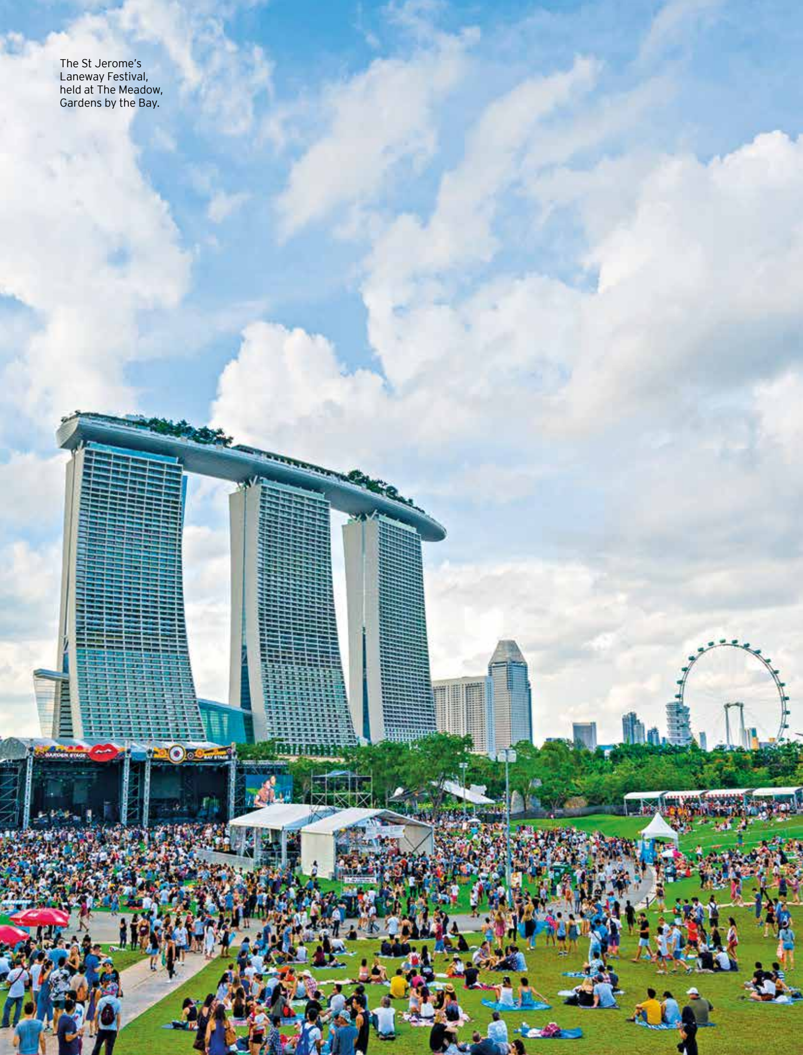
The St Jerome's Laneway Festival, held at The Meadow, Gardens by the Bay.