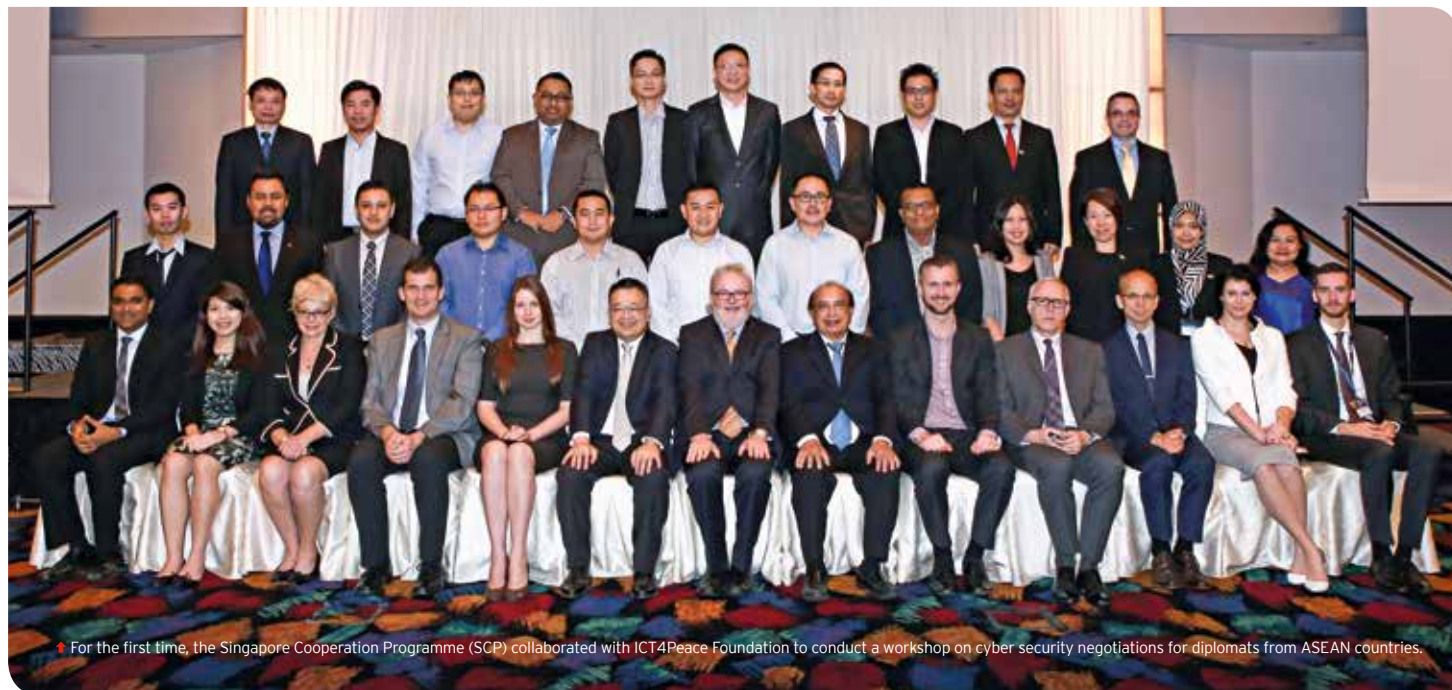
For the first time, the Singapore Cooperation Programme (SCP) collaborated with ICT4Peace Foundation to conduct a workshop on cyber security negotiations for diplomats from ASEAN countries.

at the RSIS. They covered a range of issues related to international cyber security and current consultation and negotiation efforts, such as international norms of responsible state behaviour, confidence-building measures and international cooperation.