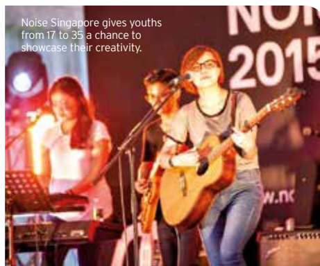
Noise Singapore gives youths from 17 to 35 a chance to showcase their creativity.