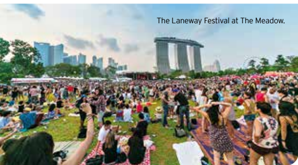
The Laneway Festival at The Meadow.