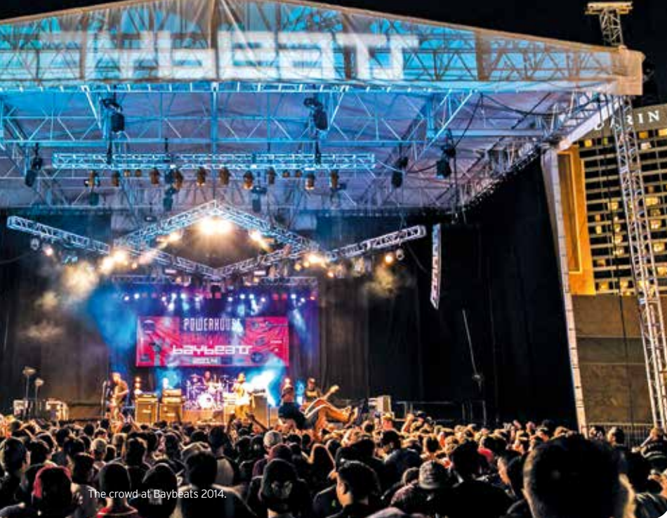
The crowd at Baybeats 2014.