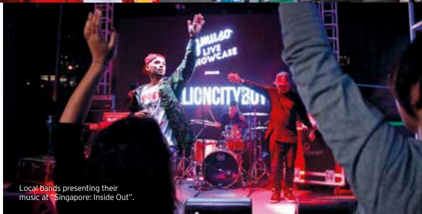
Local bands presenting their music at "Singapore: Inside Out".

Music festivals hosted in Singapore are also proving their staying prowess, attracting droves of fans year after year (see page 10). Meanwhile, more Singaporean-made music are making their mark abroad (see page 8).