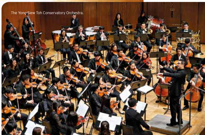
The Yong Siew Toh Conservatory Orchestra.

Music professionals can boost, refine and hone their skills with NAC's Capability Development Grant. This grant supports the continuous professional development of those who work in Singapore's arts and culture sector and can be used for workshops, masterclasses, seminars, conferences, residencies and many other training and skills development programmes. ●