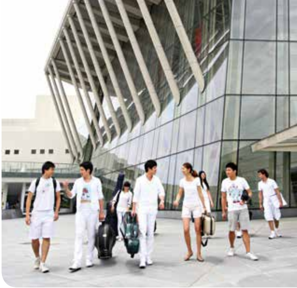
↑ Students of the Yong Siew Toh Conservatory of Music, National University of Singapore.

Amid declining compact disc (CD) sales, music juggernaut HMV pulled down the shutters of its last remaining outlet in Singapore – for good – in September 2015, sharing a fate with other music retailers, both international and homegrown, who have previously exited.