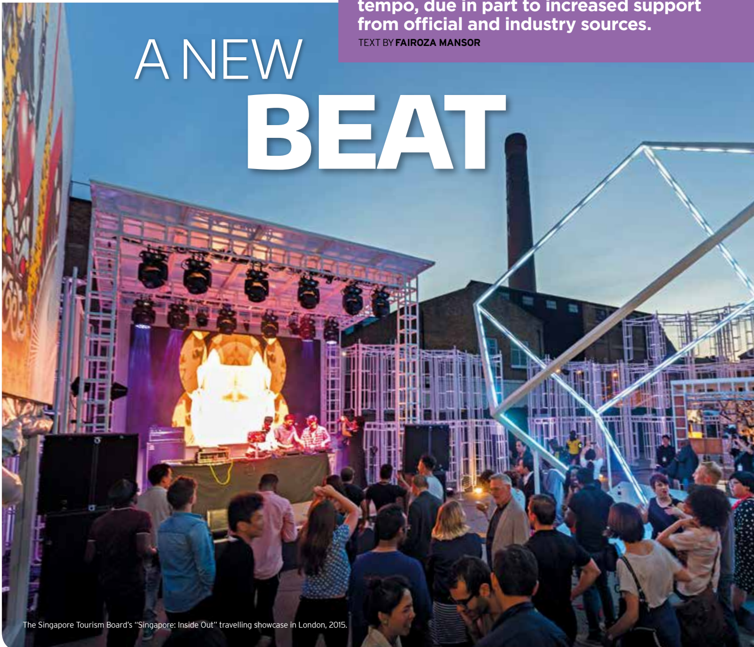
The Singapore Tourism Board's "Singapore: Inside Out" travelling showcase in London, 2015.