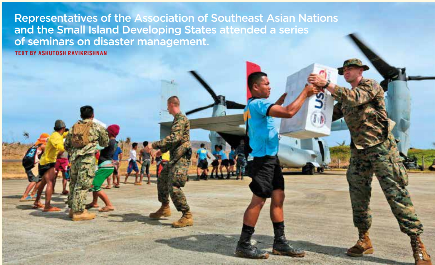
↑ Unloading humanitarian supplies through a human chain.

Amid growing calls for a consolidated regional response to infectious diseases, natural disasters, and humanitarian crises, Singapore and the United States jointly held a seminar on Humanitarian Assistance and Disaster Relief (HADR) in September 2014 for 31 officials from Association of Southeast Asian Nations (ASEAN) member states. The seminar was held under the ambit of the Singapore-United States Third Country Training Programme (TCTP) which is aimed at promoting sustainable development, connectivity, and building resilience in Southeast Asia.