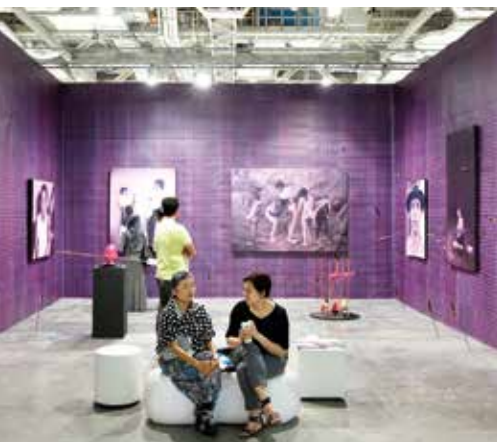
↑ Nine days in a week pg6

"A rt is a nation's most precious heritage." – Lyndon Johnson, former United States President