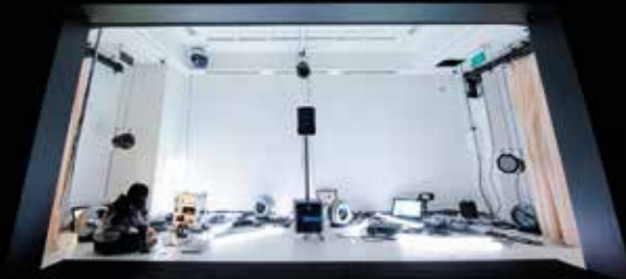
↑ Ho Tzu Nyen (Singapore) - PYTHAGORAS