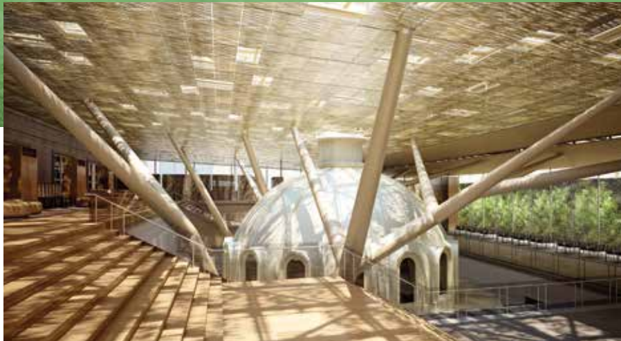
↑ The National Gallery Singapore, spanning 64,000 sq m, is one of the largest visual arts venues in the region.

Concert Hall complex reopened to great fanfare in 2014 after extensive renovation. Similar enthusiasm from the arts community is expected when refurbishment of the Asian Civilisations Museum is completed later this year. As a result of the development of National Gallery Singapore and Victoria Theatre and Concert Hall, Government funding for the arts and cultural sector rose to S$677.3 million in 2013, up from S$541.4 million in 2012.